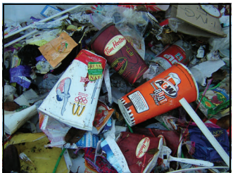
Typical litter collected by volunteers while cleaning their adopted routes.

cleaned up by a small number of volunteers — it is on the other hand, a tremendous amount of litter to enter the environment in the first place. Considering that the average household puts out only one bag of garbage on the curb each week, making for 52 bags a year— 683 bags of litter accounts for a large amount of litterbugs in our community. This reveals the need to increase awareness to the problems of litter in the environment and the need for many to practice ecological citizenship. How do we reach the unconverted? It starts with being an example—working from your corner. Adopt-A-Block would like to thank all their hard working volunteers for being an example to others in the community— demonstrating that litter is everyone’s responsibility and that we can all ‘pitch-in’ and make a difference towards the health and beauty of our environment.