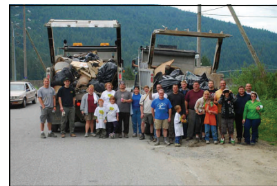
2009 Stave Lake Clean-Up Crew