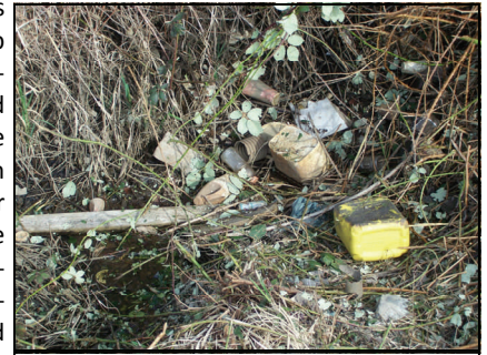
Litter debris found in a section of Lane Creek in the Industrial Area. (Picture taken February 2010)

Applications for the Fall Litter Clean-Up are now being accepted until June 30th and are available on the society's website. All interested Mission non-profits are welcome to apply. Groups selected to participate in a clean-up will be rewarded $250 for their effort.